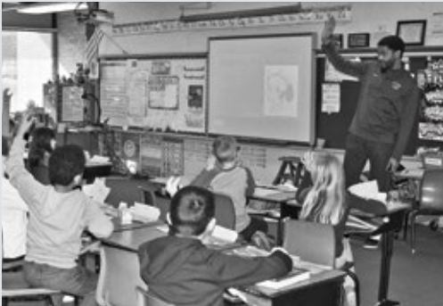
Prevention education coordinator and students

PREVENTION There was a 41% increase in 3rd and 4th grade students who demonstrated understanding that sexual abuse perpetrators are not usually strangers, but rather are typically someone the family knows and trusts. At post-test, 75% of 1st and 2nd graders demonstrated understanding that kids can be tricked and lured into abuse by adults. At posttest, 75% of middle schoolers demonstrated understanding that bystanders can and should safely intervene when they witness bullying.